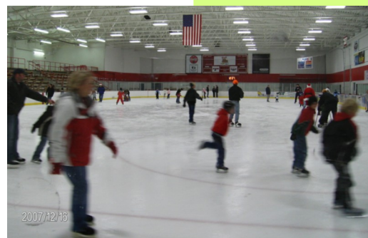
*Moose Sherritt Ice Arena is located at the East end of the Monticello Middle School.

Adults: $3, Children ages 5-17 years: $2 Children 4 & under: FREE MCC Members: FREE Skate Rental: $3/pair